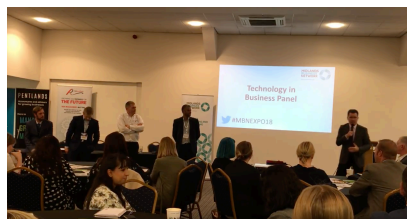
KAZ speaking at the Midlands Business Expo

calculator on our website. Teach and equip your staff with the essentials and build on their skill set. Some of our clients are offering incentives, as they realise just how much of a difference it can make to their business, staffing and bottom line. It's one of the cheapest courses on the marketplace and one that really does make a huge difference. Available in SCORM for LMS or Online, hosted on our servers.